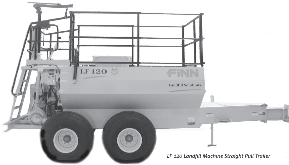
LF 120 Landfill Machine Straight Pull Trailer

The FINN LF120 Landfill Machine is a real workhorse with a 1,000 gallon working tank capacity. FINN developed HydroSeeder® technology in 1953. We've been the industry leader in quality and innovation ever since. With the FINN LF120, you don't have to settle for less than proven FINN quality to tackle a wide range of highly demanding hydroseeding applications.