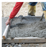
Driveway / Sidewalk Contractors